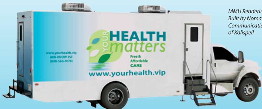
MMU Rendering. Built by Nomad Global Communication Solutions of Kalispell.